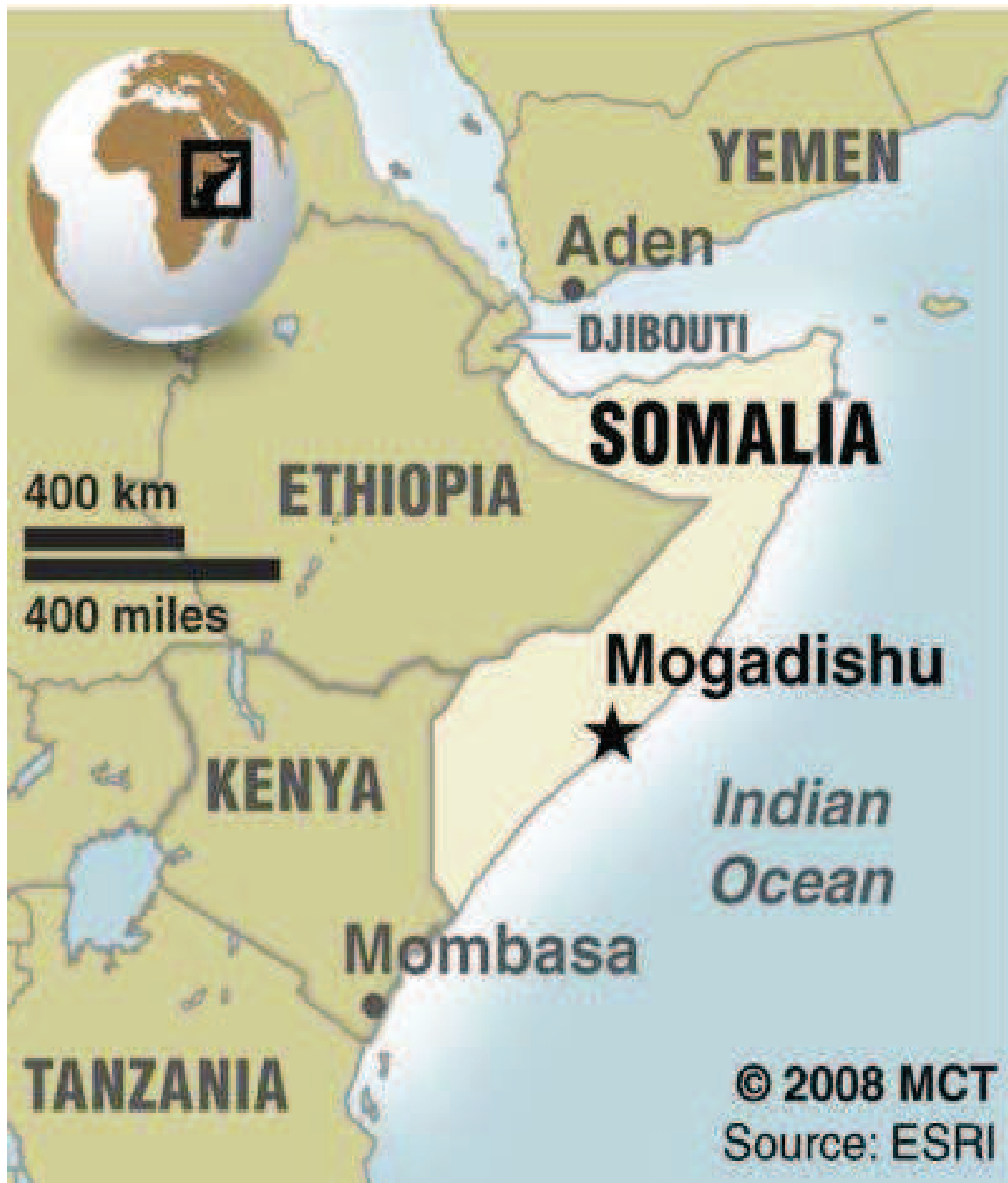
Map 1: Somalia and its neighbors