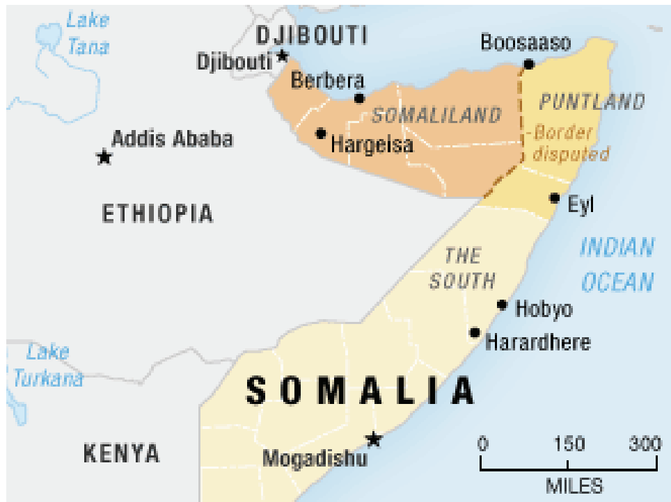
Map 2: Map of Somaliland and Puntland