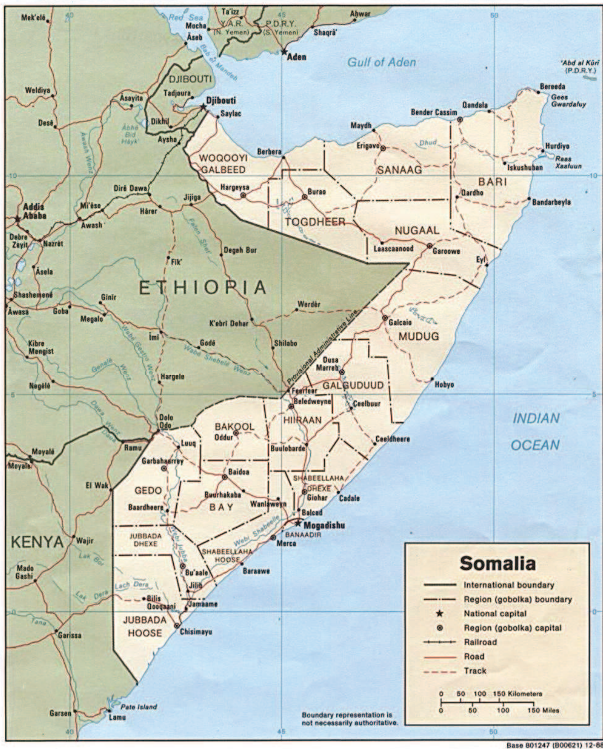
Map 4: The Somali-Ethiopian border