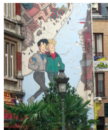
Typical comic strip wall painting in Brussels

During a study trip to Brussels and Geneva participants visit various international institutions, non-governmental organisations and think tanks (such as: WTO, UNCTAD, UNHCR, EU Parliament and Commission, South Centre, International Crisis Group and others). These visits provide the opportunity to obtain practical insights into processes of international policy making.