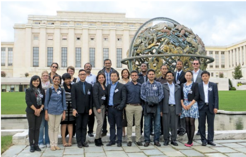
Participants of MGG Academy 2013 in front of Palais des Nations, Geneva