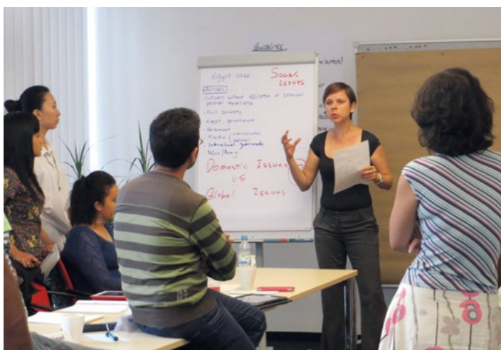
Group work - participants of MGG Academy 2013