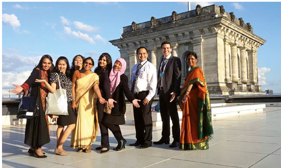
Participants of MGG Academy 2014 in Berlin