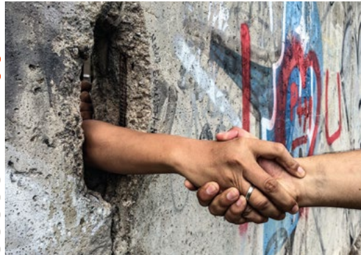
Handshake through Berlin Wall