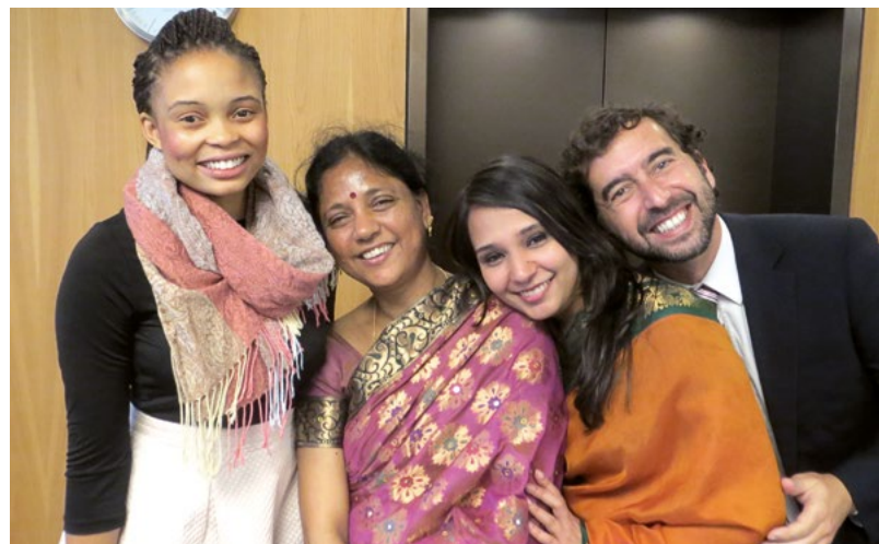
BMZ farewell reception, participants of MGG Academy 2014

The implementation of these ambitious endeavours for a sustainable, inclusive world order is impossible without the contributions of rising powers and developing countries. The Managing Global Governance (MGG) programme, which is financed by the Federal Ministry for Economic Cooperation and Development (BMZ), aims at building strategic partnerships with important rising powers such as Brazil, China, India, Indonesia, Mexico and South Africa.