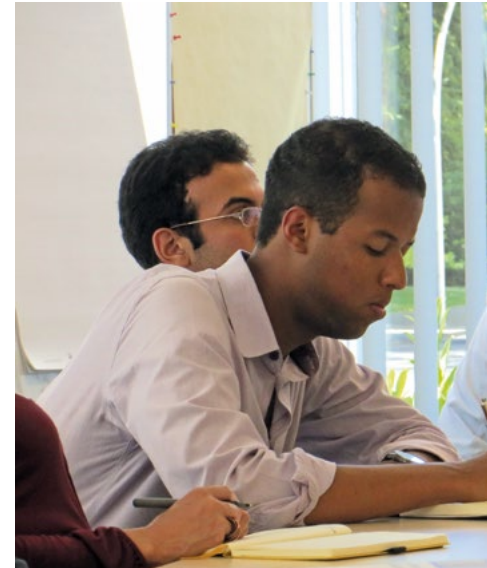
Participants of MGG Academy 2013

T he MGG Academy is a central pillar of the MGG programme. The dialogue and advanced training course brings together young professionals from rising powers of the South and from Germany. Its overarching purpose is to support the development of future change makers who are dedicated to transformational change. The Academy further intends to strengthen the capacities of partner institutions in co-shaping the process of global transformation. At the same time, it strives to enhance the understanding of policy-makers and scholars in Germany and Europe about values, worldviews and policy priorities in rising powers.