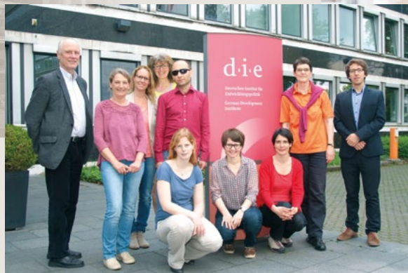
Staff of Training Department