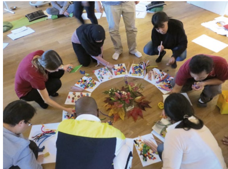
Leadership session with participants of MGG Academy 2015

In the third leadership session the participants will reflect on their learnings on an individual and team level. Furthermore they will specify their personal lessons learned out of the entire journey and how these experiences will change their professional life after returning to their countries and workplace. Participants will explore which structures can help them to implement these changes back home.